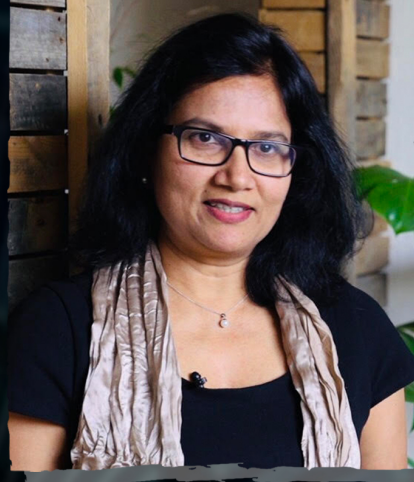
Producer, Creatice Director, Story, Research and Medical Editing