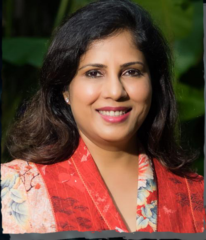
Producer Research & Story